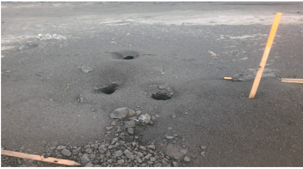
Figure 1. Drilled and install dewatering fracture line.