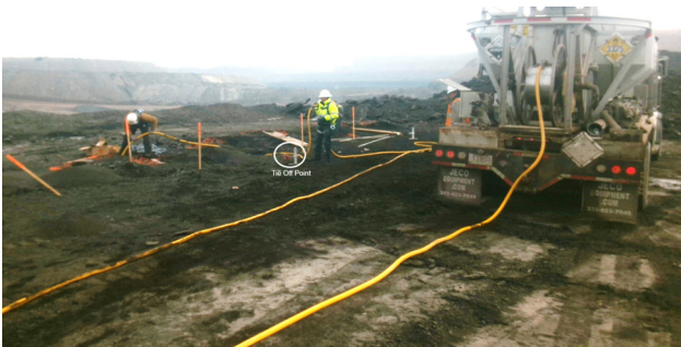
Figure 2. Resulting ground instability between fracture line and face crest.